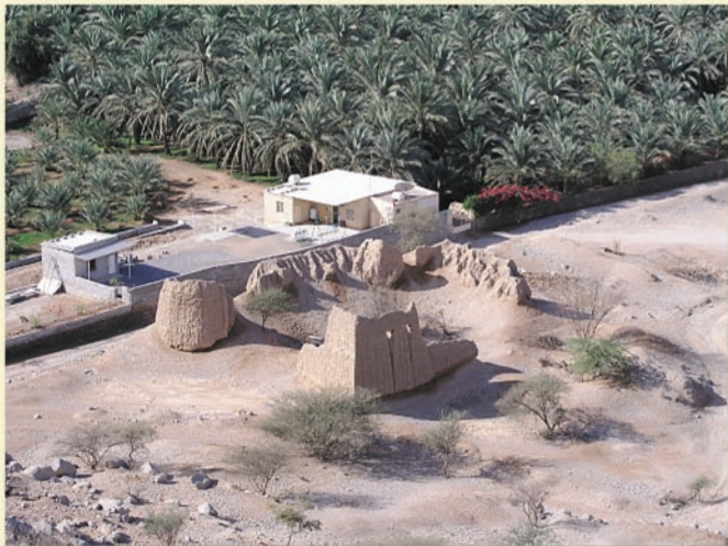
The lower fort