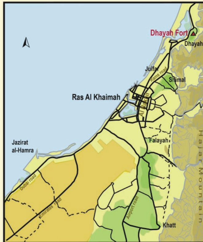
Location of Dhayah Fort