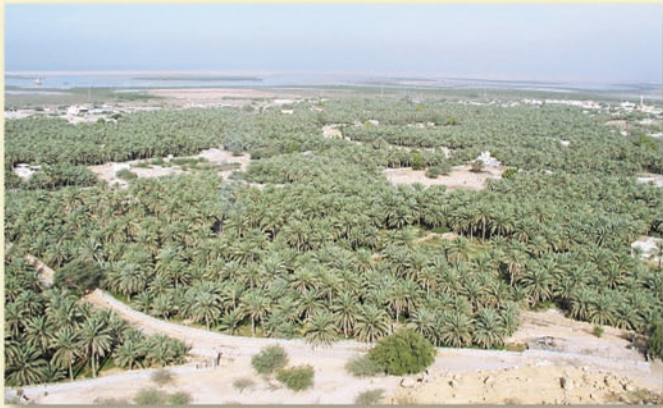
The palmgardens below the fort