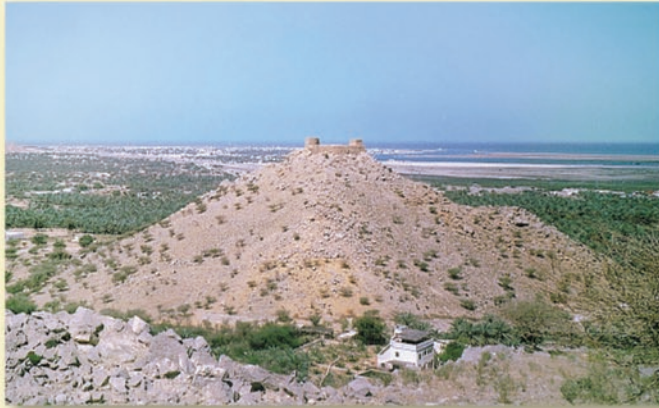
Dhayah with hill, fort and palm gardens

With a backdrop of steep mountains, the bay of Dhayah has always been a very fertile area and has been settled in at least since the third millenium BC.